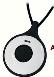
Automatic Fall Alert Button