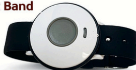
Basic Button Wrist Band

Our Personal Alarms provide peace of mind with just the press of a button. They're designed to handle urgent situations, be it for health concerns or home emergencies.